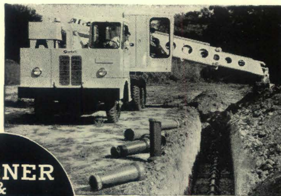
Gradall backfilling over drain tile.

Stubbornness may give some people a strange sort of twisted satisfaction, but it can deprive them of a great deal, too—including wages.