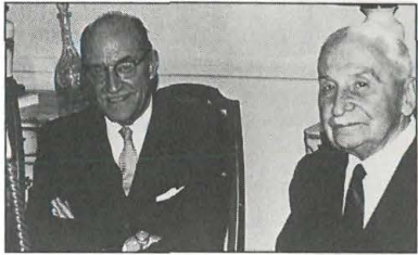
Henry Hazlitt and Ludwig von Mises

The Ludwig von Mises Institute was honored to have Henry Hazlitt as a Distinguished Advisor, and to be named a principal heir of his estate.